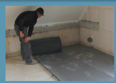
Unroll the Insulit Bi+20 rolls edgeto-edge