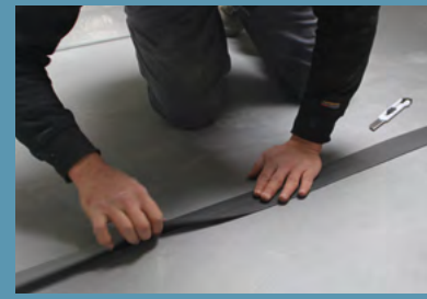
Insure the tightness with the Stickelfoam 25/70