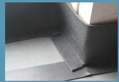
Place the strip L-foam sides against the wall