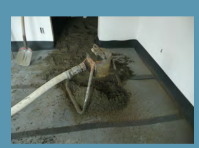
Make a ± 8 cm thick reinforced screed on the Bi+20